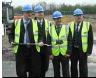
Vice-chancellor (l) holds space

The Sports Centre, designed by Arup Associates and expected to open in October 2013, has at its core a sports hall housing two