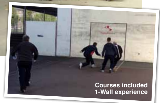
Courses included 1-Wall experience

'This was a practical demonstration of the Fives Federation at work'