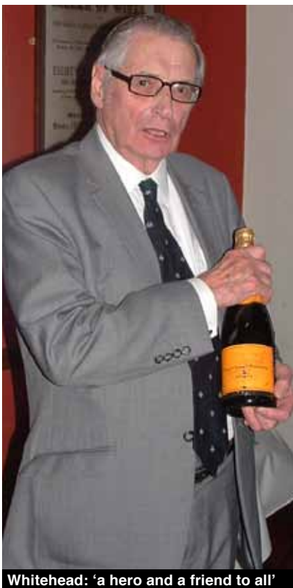
Whitehead: 'a hero and a friend to all'