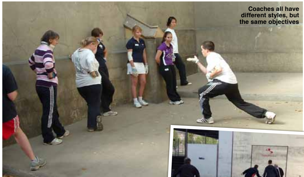
Coaches all have different styles, but the same objectives