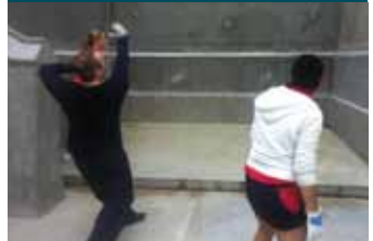
The Friston Place court in use