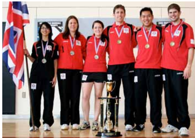
The British players are hoping to improve on their 2009 success