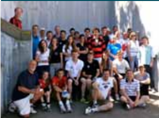
Before the rain hit in Geneva