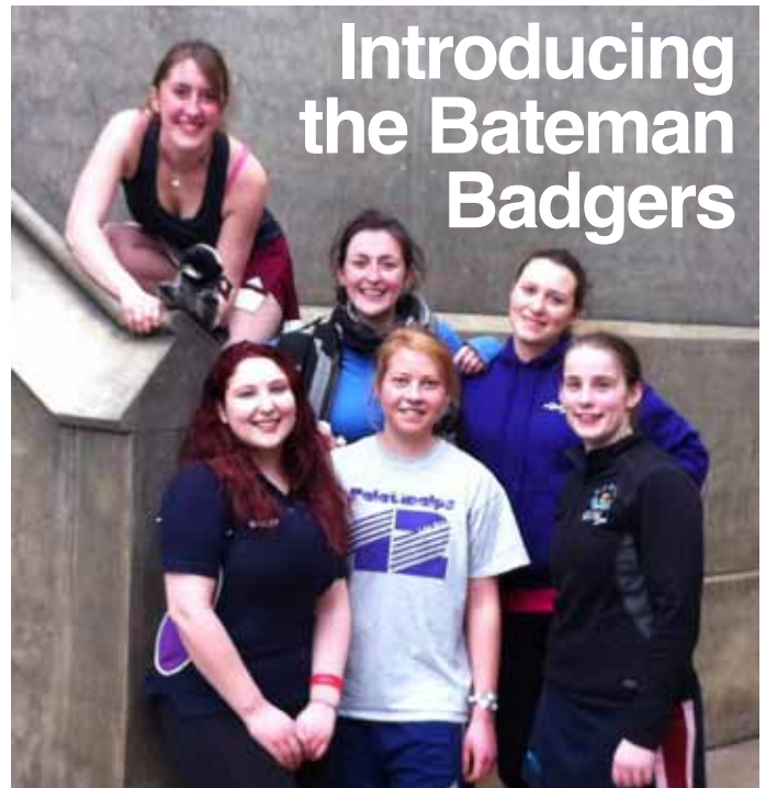
The girls are looking to play more fixtures in their second season

This season has been the first for the Bateman Badgers, a new independent ladies' club.